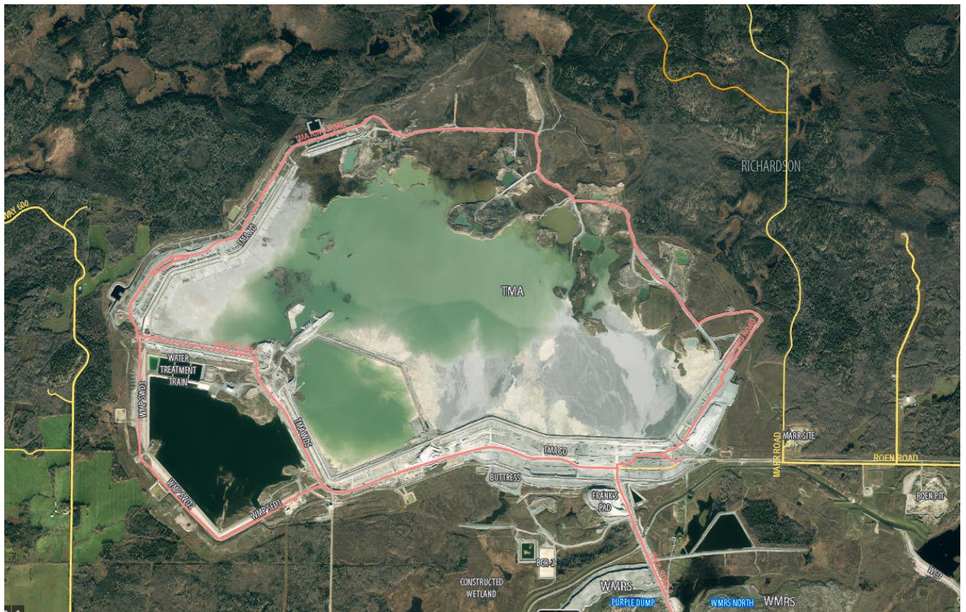
Fig. 1. Plan View of TMA