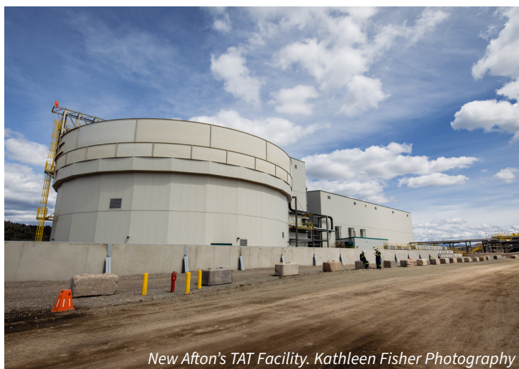
New Afton's TAT Facility.

TAT was identified as an objective for New Afton in 2017, with early preparations beginning in 2018. The existing New Afton Tailings Storage Facility (NATSF) was not