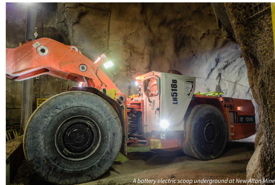
A battery electric scoop underground at New Afton Mine.

People are the key to successful energy management. Without the passionate support and buy-in of New Afton's employees, the mine would not have accomplished nearly as much as it has over the past 11 years. New Afton employees have stepped up and showed the world that Energy Matters!