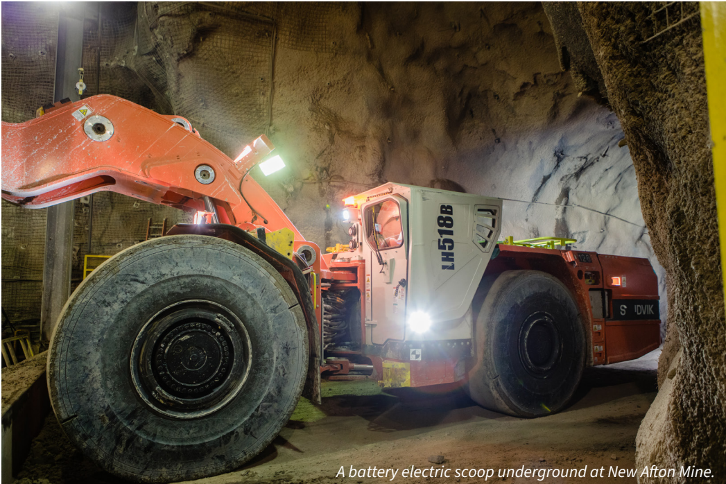
A battery electric scoop underground at New Afton Mine.