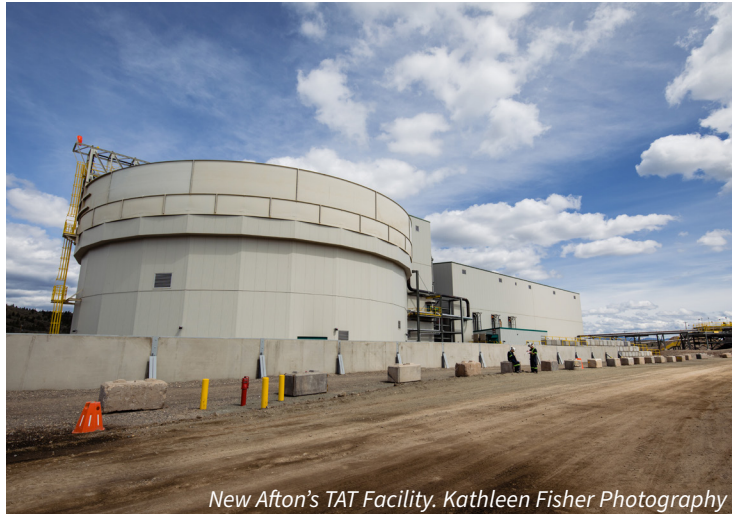
New Afton’s TAT Facility.

TAT was identified as an objective for New Afton in 2017, with early preparations beginning in 2018. The existing New Afton Tailings Storage Facility (NATSF) was not