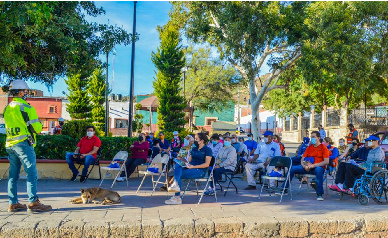
▲ Cerro San Pedro community meeting.

The Member States of the UN unanimously agreed upon the 17 UN SDGs in 2015 as part of its “Agenda 2030.” The UN SDGs are implemented by countries with the support of the UN Development Program (UNDP); as part of the process, governments require action from business, civil society and citizens to help fulfill the ambitions of the UN SDGs.