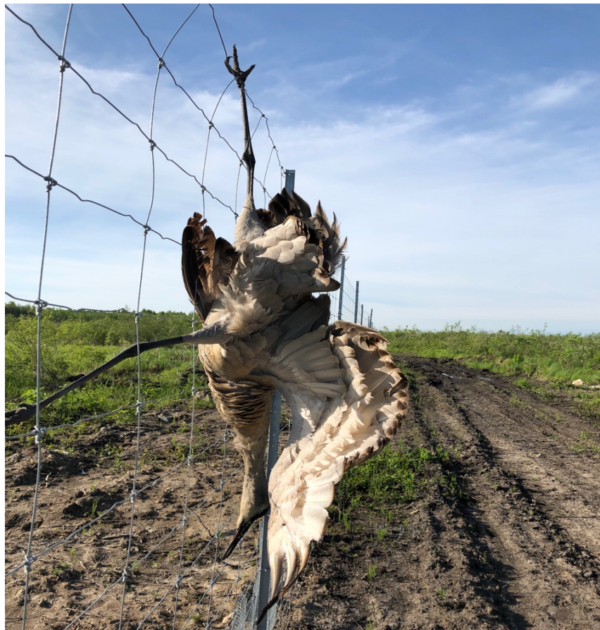
Photo 1. Deceased Sandhill Crane entangled in fencing.

On June 21, 2019 at 0815 a Sandhill Crane was discovered deceased and entangled in the Wildlife Exclusion Fence (See photo 1).