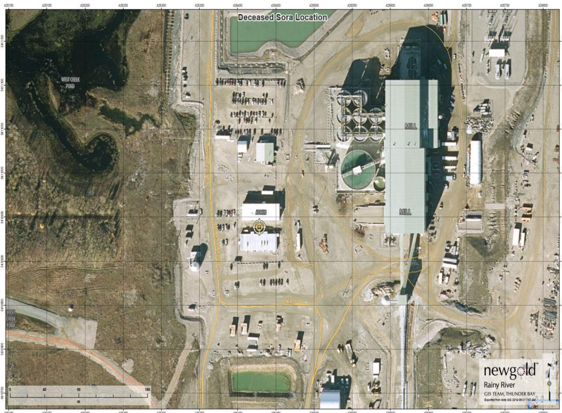
Photo 1. Site image with location marked out by bulls eye.

On June 18, 2019 at 0830 a deceased Sora was discovered in the parking lot between the Mine dry and the Admin building. (See on photo 1)