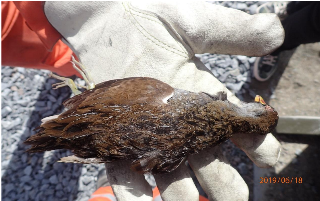
Photo 2. Deceased Sora with damage to head and neck.

A Sora was found dead in the parking lot with damage to its head and neck (Photo 2). The incident report stated that it is suspected the bird collided with a vehicle near the West Creek Pond and when the vehicle stopped the bird dropped off the vehicle.