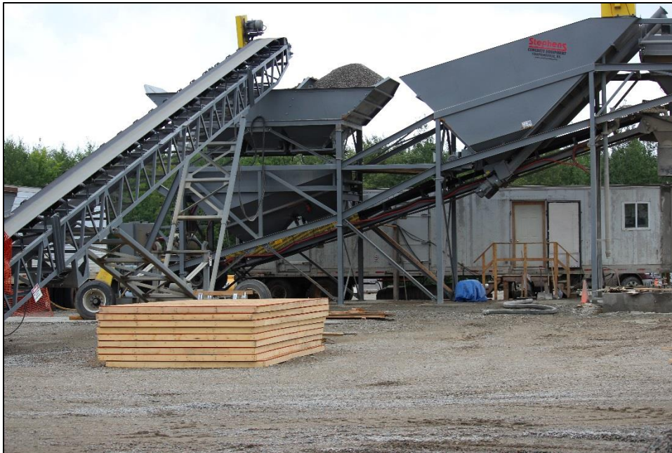
Outcrop 3 Quarry (July 2015):