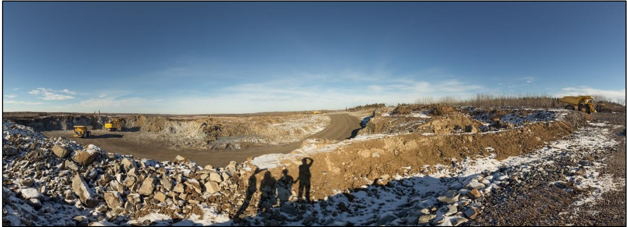
Open pit development (December 4, 2015):